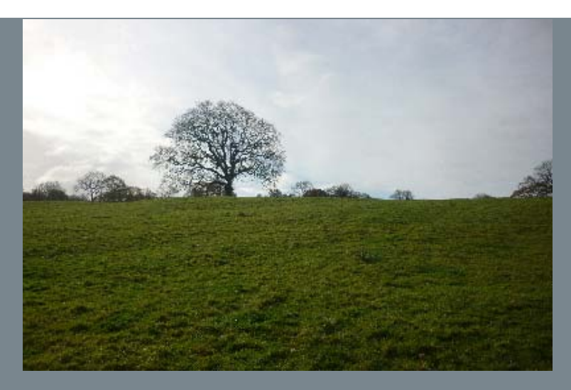
From this point there is a long steady climb to Rodhill Lane. Beyond the tree a path leads into the next field