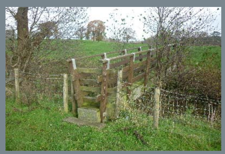
and then continue to reach a lane.