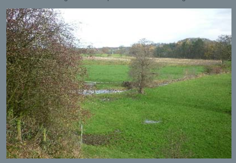
Bear right to a stile up a rise and then cross to a kissing gate.