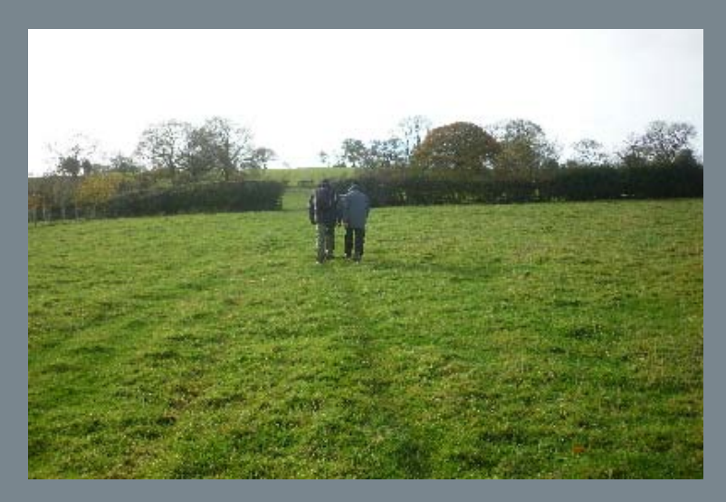
Cross this to a squeeze stile followed by a stile over an electrified fence.