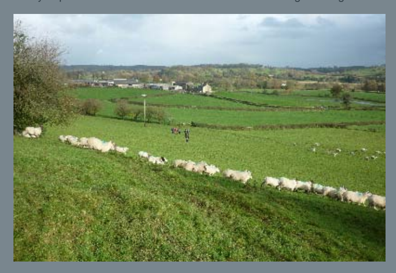
As you near the farm complex bear right through a metal gate and cross the field to another.