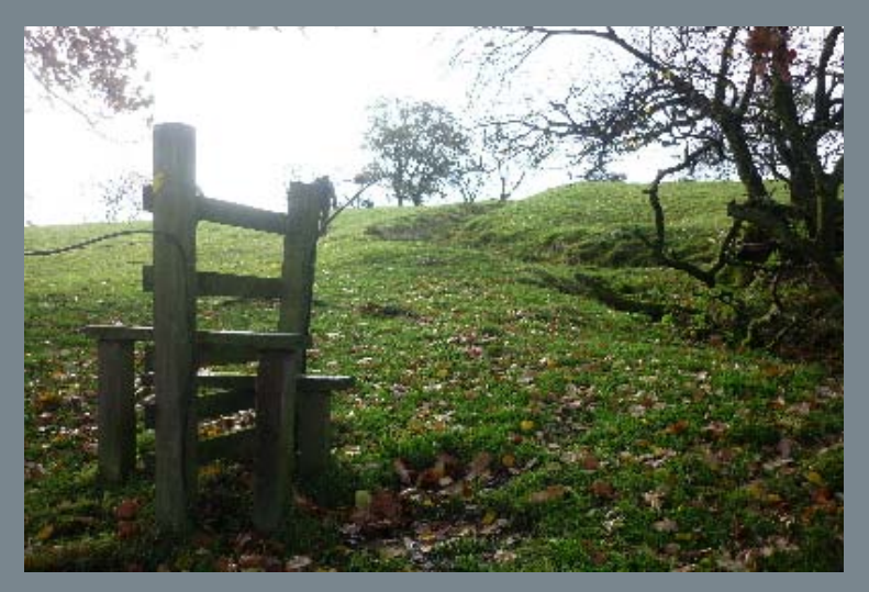
Keep ahead to you arrive at a stone barn.