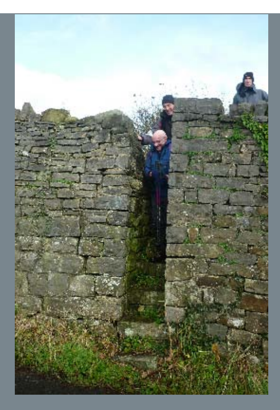
Turn left. As you walk into the hamlet of Holden turn right