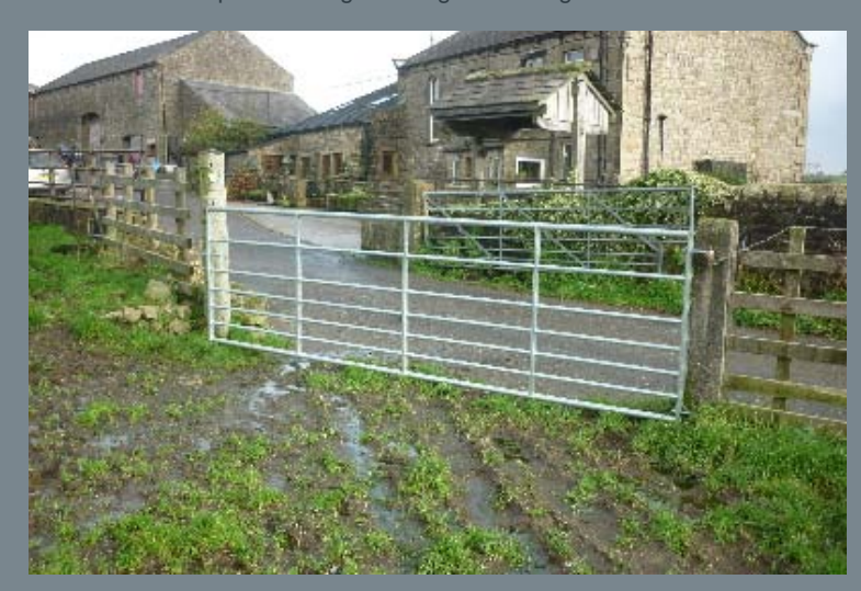
After this turn left to walk through the farm yard following waymark signs that will lead to a pair of metal gates at the far end of the farm.