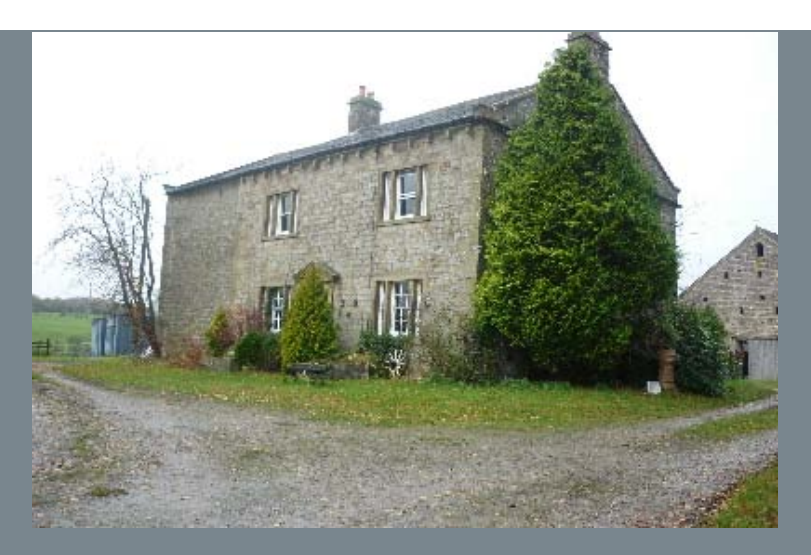
Keep ahead through the yard and after a kissing gate, drop down to a substantial footbridge.