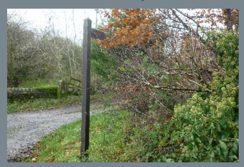
onto the drive of a substantial farm house.

Pendle from the Nick Pendle sunrise Penwortham Preston - Avenham Park Ramsbottom Rivington Reservoirs Rufford Silverdale and Leighton Moss Silverdale & Arnside Knott Scottish Bowland Spitlers Edge A circuit of Stocks Reservoir Waddington-Slaidburn Weets Hill Whalley Witton Park Worden Park