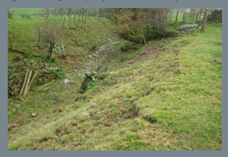
"Sunken" is apt - in winter this by-way is a boggy morass that is best avoided. After wet weather it may be best not to cross the stile but follow the fence down to reach the lower reaches of the lane.