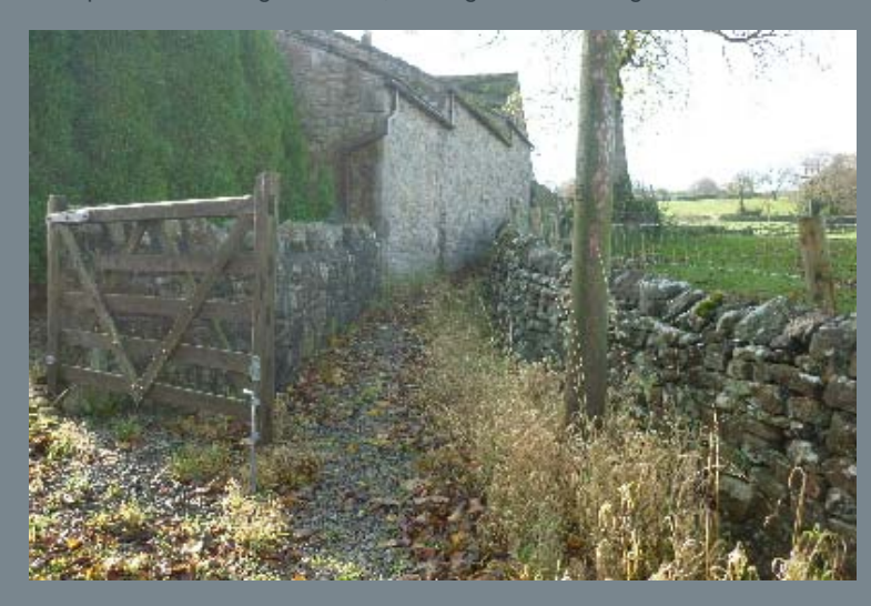
Keep ahead across the next field and after crossing a track by means of a pair of stone stiles

There are two footpaths here - keep ahead towards the farm house. As the track nears the buildings take a footpath that passes to the right of them, leading to a wooden gate.