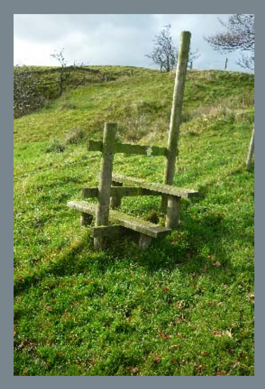
aim for another on the skyline to the right.