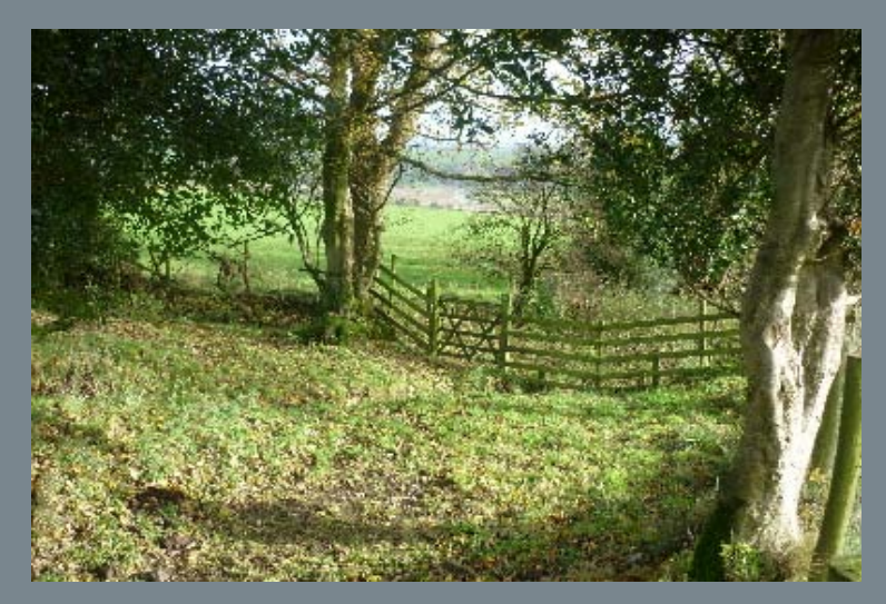
This leads onto a farm road.