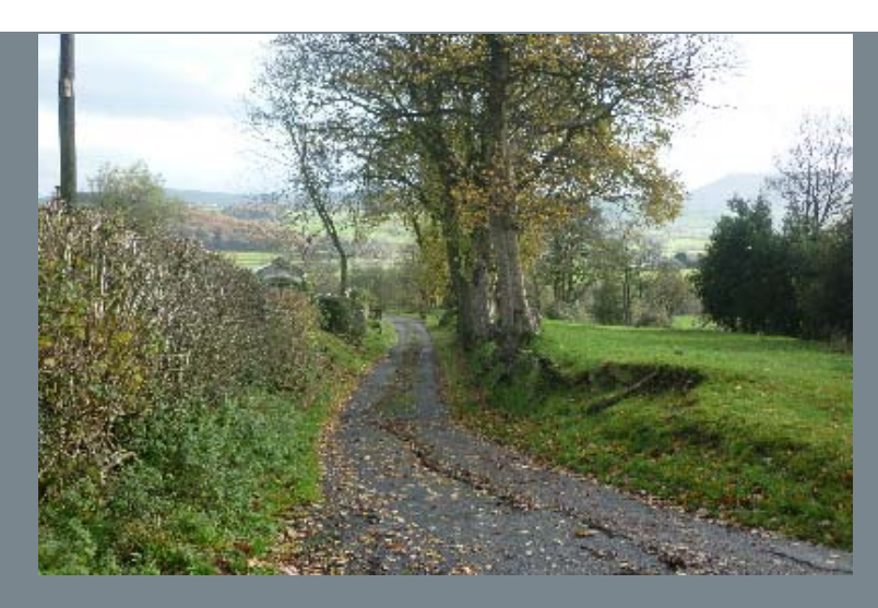
Keep ahead but as you pass Rodhill Gate bear left across fields heading to a large farm called Hague.