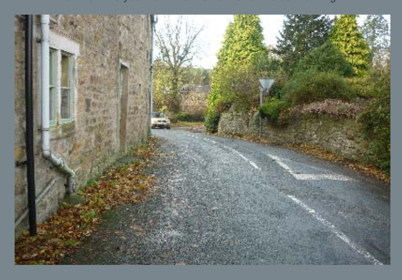
and then left again onto a farm track.