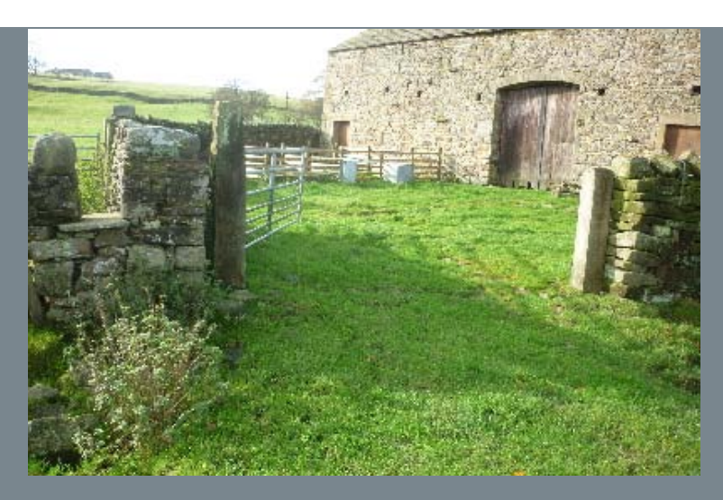
By now you should be admiring the views towards Pendle. From the barn cross the next field to a metal gate below the well named farm of Higher Heights. And then cross to large fields bearing slightly right. After a stile into the second field