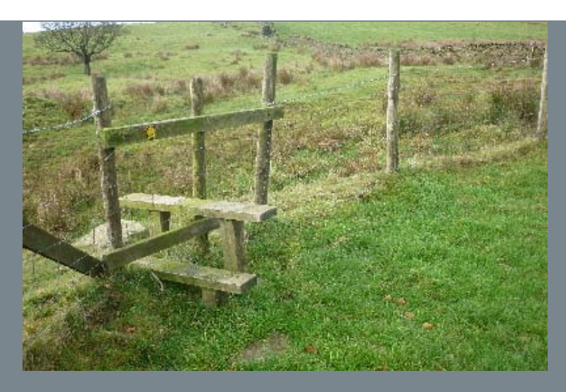
Crossing this and turning left will place you on a sunken bridleway named Rodhill Lane.