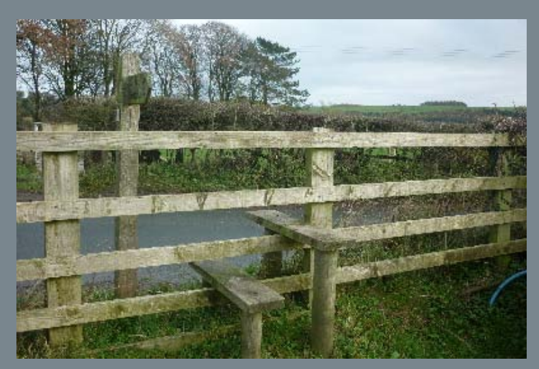
Continuing across the lane the footpath will lead you back to Bolton by Bowland but necessitates crossing a ford which in winter can be impassable.Instead turn left and then opposite Bolton Peel