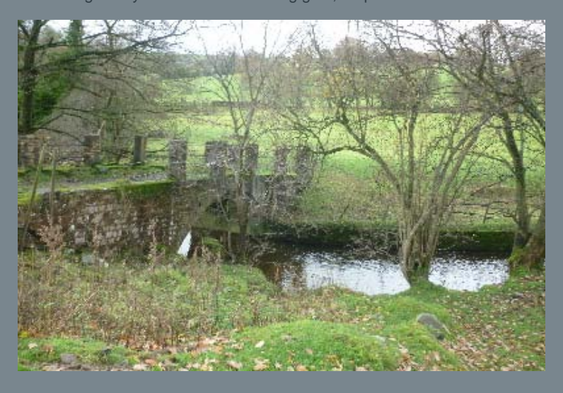
After crossing this bear right and go through a kissing gate leading onto a track.