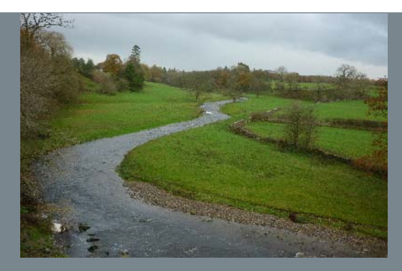
After 15 minutes cross a stile close to a garden centre.