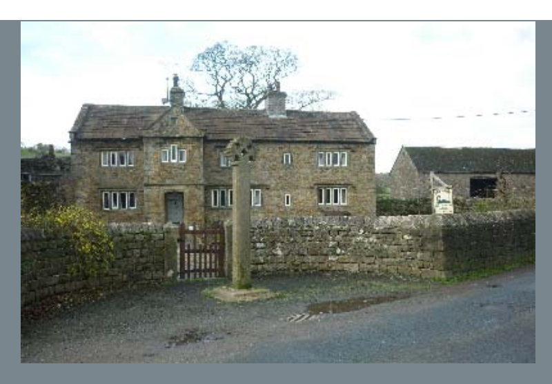
turn right onto a footpath and cross a footbridge.